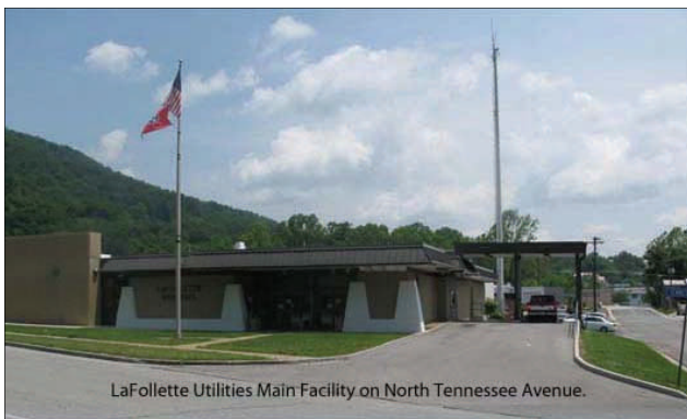
LaFollette Utilities Main Facility on North Tennessee Avenue.